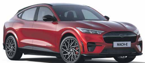
Rapid Red 2