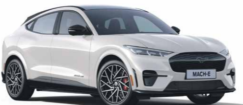
Star White 1

Colours are representative only. 1. Star White only available on GT models. 2. Rapid Red not available in RWD.