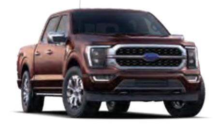
STANDARD with optional equipment.