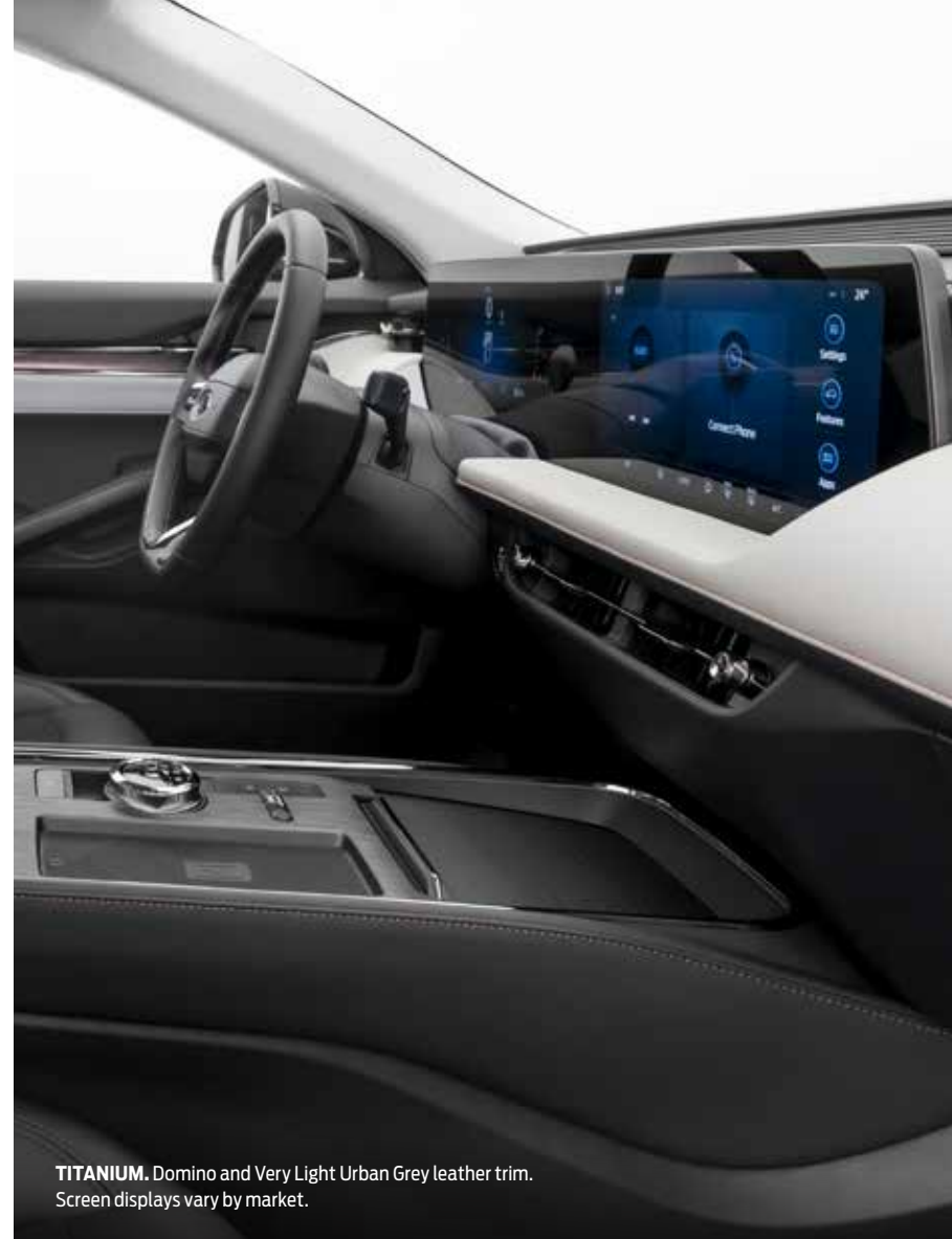
TITANIUM. Domino and Very Light Urban Grey leather trim. Screen displays vary by market.

The Ford Taurus sedan brings the spirit of excitement to the everyday driver. SYNC® 4 provides fast and simple access to your audio sources and lets you interact with select mobile apps while keeping your eyes on the road. Voice commands, steering wheel buttons, or a quick tap on your 13.2" touchscreen will give you control of your compatible mobile apps. Connect your compatible iPhone® with Apple CarPlay® 1 to give you access to Apple Music® and use Siri® to send and receive hands-free text messages. 2 If you have a compatible Android™ phone, Android Auto™ 3 connects to Google Maps™ and the Google Assistant™ personal assistant for pass-through voice commands. The available Wireless Charging pad is located in the center console and it allows you to charge your smartphone without a cord. The Taurus brand supports Qi wireless charging protocol. 4 And the Rotary Gear Shifter enables you to take control of the eight-speed automatic transmission with the simple turn of the dial.