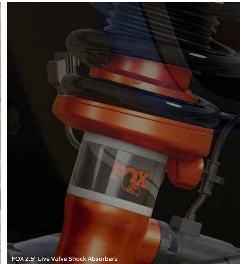
FOX 2.5" Live Valve Shock Absorbers

Cutting-edge internal bypass dampers tuned and developed by Ford Performance can react and adjust to the terrain and driving style 500 times a second. Get ready for the ride of your life.