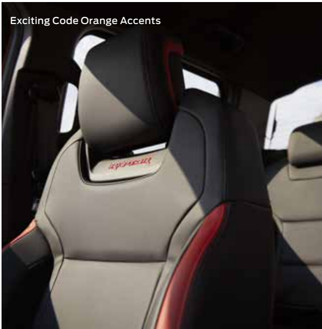
Exciting Code Orange Accents