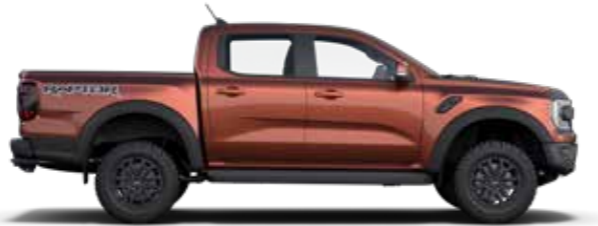
Sedona Orange 1