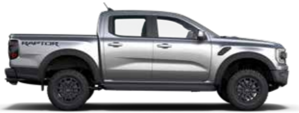
Aluminum Metallic 1