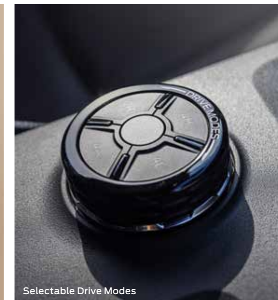
Selectable Drive Modes