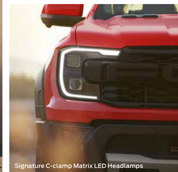
Signature C-clamp Matrix LED Headlamps