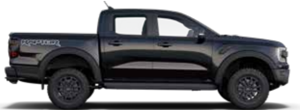
Absolute Black 1