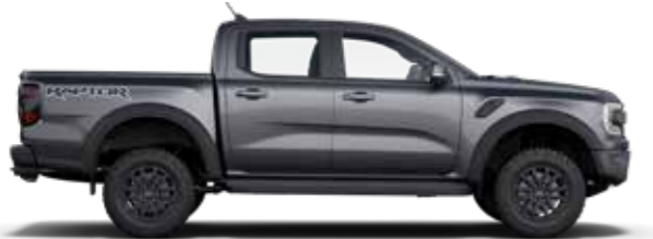
Meteor Grey 1