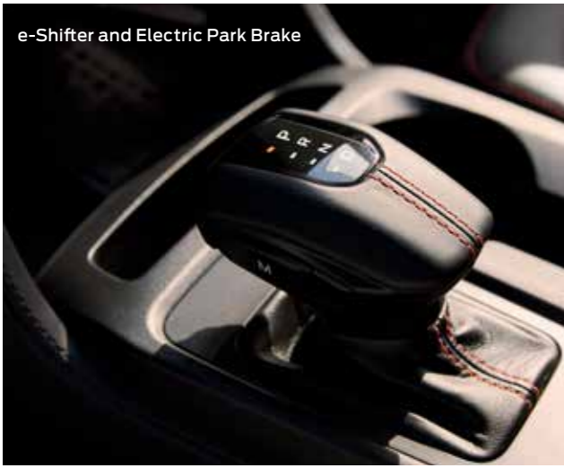
e-Shifter and Electric Park Brake