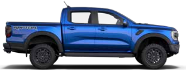
Blue Lightning 1