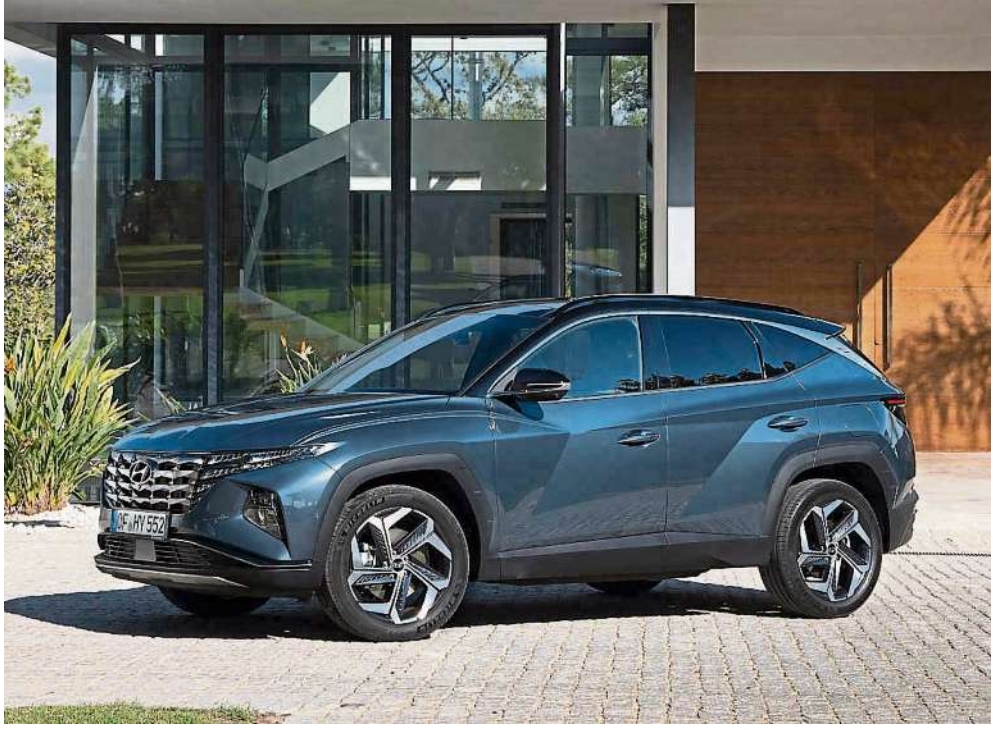
The Hyundai Tucson earned a five-star safety rating from the Euro NCAP

In addition to its seven-airbag system enhanced to keep front-seat passengers even safer, the all-new Tucson's upgraded safety package now includes Highway Driving Assist