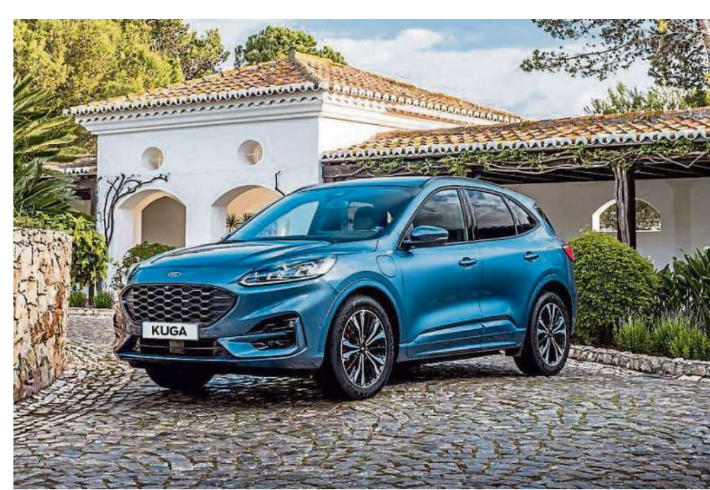
The Ford Kuga delivers deliver distinctive style, choice and premium comfort

New Stop & Go, Speed Sign Recognition and Centring technologies help drivers negotiate stop-start and highway traffic with greater confidence than ever while predictive