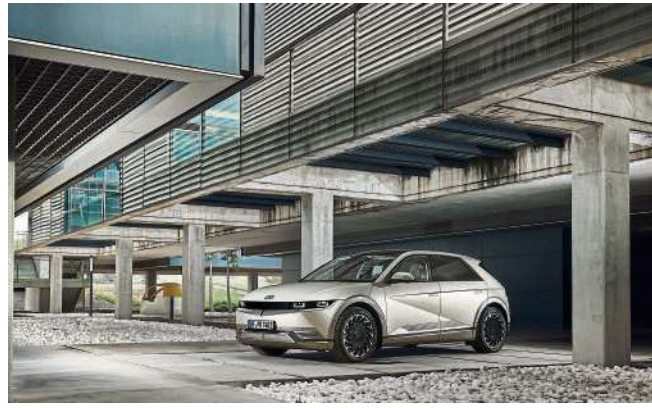
The Hyundai IONIQ received a five-star rating

Hyundai has been producing models that have regularly received Euro NCAP's top safety rating. With the most recent additions being Tucson and IONIQ 5, former Hyundai models that have earned the maximum five-star rating include the i30, Kona, Santa Fe, IONIQ and Nexo.