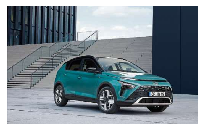
The Hyundai Bayon