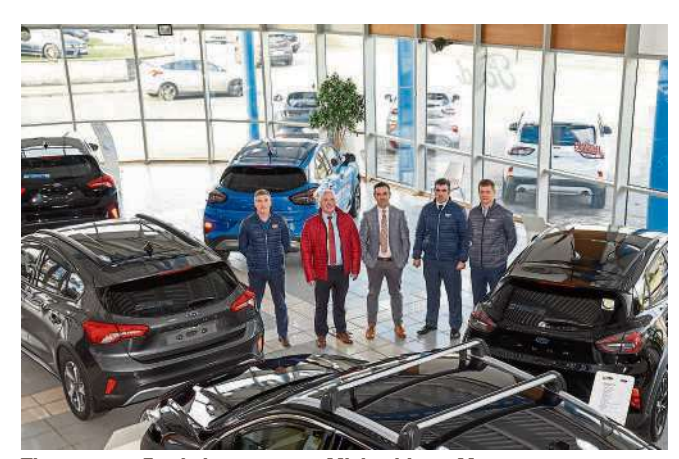
The current Ford showroom at Michael Lyng Motors

With all the used car imports, all the main franchise dealers were full of used car stock. In the middle of 2009 the then Minister for the Environment stated that by 2020 there would be 350,000 electric vehicles on Irish roads. However, by January 2020 there were shy of 5,000 fully electric vehicles in Ireland. CONTINUED ON PAGE 51 →